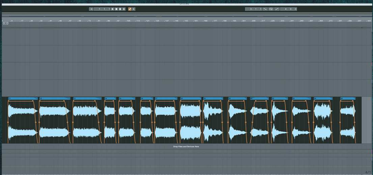
Adding fades to our atmosphere sounds

Adding fades are also important - without fades, clicks would be heard at the start point and end point, if they were not at the zero line and applying EQ or noise reduction is also good way to reduce unwanted noises in the recording. The use of compressors helps to balance the overall amplitude of sound.